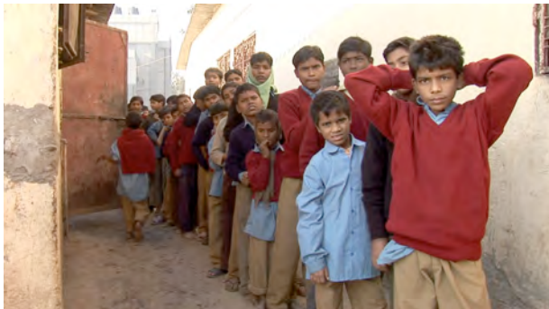
'Labourers' - Still from David MacDougall's 'Gandhi's Children'