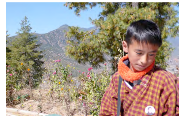
Bhutan/Paro December 2009

Link to the official travel guide to Århus: www.visitaarhus.com