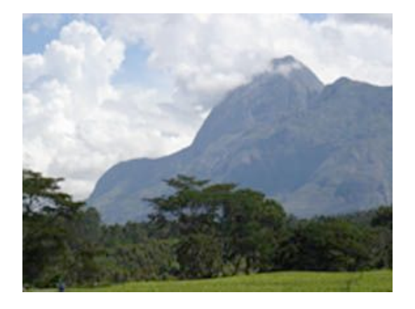
The Mystery Mountain

Through its hybrid approach, the film-maker aims to explore new trends in visual anthropology touching upon intimacy and subjectivity. http://www.itsushikawase.com/room.html